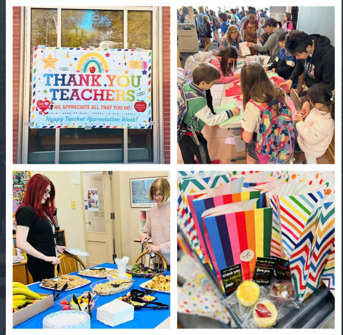
Photographs from William H Lincoln PTO on Instagram.

We would like to thank all the school PTOs for taking various initiatives to make the week special for our staff.